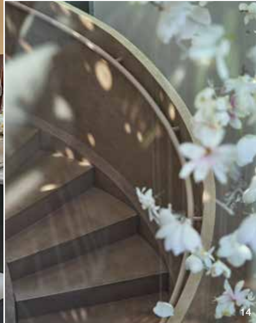
11. 自然植物的布局位置重視易於照顧與維護。12. 位於腹地一隅，半開放的包廂空間，可用於小型活動之用。13. 柔曲的樓梯造型，令空間顯得溫柔，更符合女性的視角與喜好。14. 上海市花白玉蘭作為樓梯空間的主花藝表現，在天光照拂下宛若向陽而生。 11. Plants are placed in a certain position where they are easily provided daily maintenance. 12. Half open lounge can host small events. 13. Curving staircase is gentle and elegant. 14. White magnolia is the major flower arranged along the staircase.